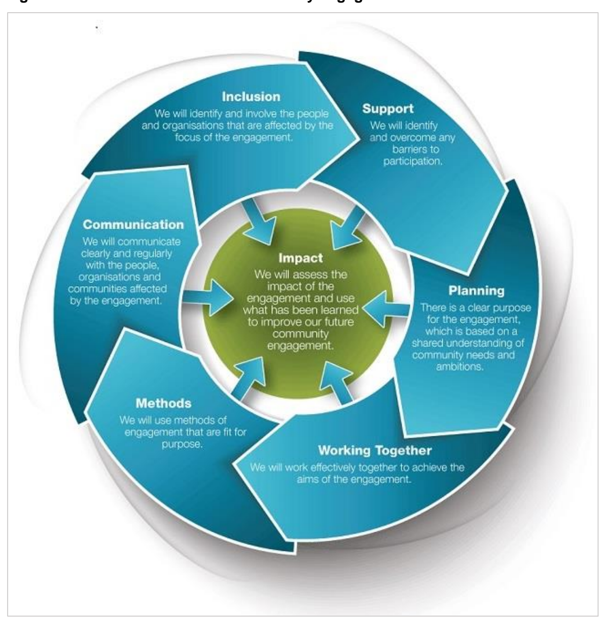
Figure 5. National Standards for community engagement

present a real threat to achieving the 1% target. However, in this current climate of change, PB still represents an important means of engaging local populations and equalities groups, building trust and ultimately facilitating neighbourhood improvements. All efforts to encourage community participation should align with the national standards for community engagement, as outlined in Figure 5 below<sup>154</sup>.