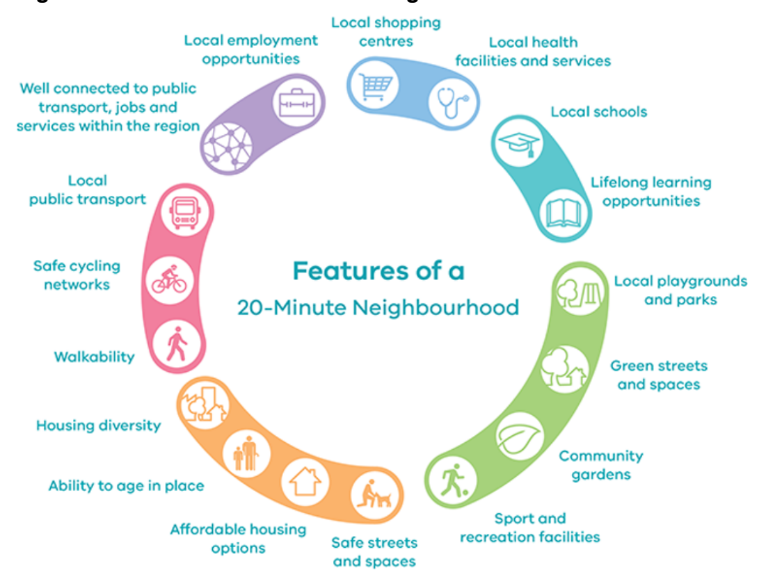
Figure 2. Features of a 20-minute Neighbourhood

The Scottish Government's Programme for Government in September 2020 included a commitment to provide funding for local authorities to support the establishment of 20-minute neighbourhoods. The concept of a 20-minute neighbourhood is a simple one; through sustainable travel, residents should be able to access most of what they need within 20 minutes of their home. Within Glasgow, this provides an opportunity to pilot measures within designated communities, as well as allowing the principles of the 20-minute neighbourhood to be applied more widely through regeneration and planning practice. The concept aligns with the shift towards more adaptable working practice, as well as the Council's commitment to a Liveable Neighbourhoods Plan, which will aim to reduce car dependency and increase active travel through a range of place measures. Figure 2 shows the features identified by Victoria State Government, Australia, in planning for 20-minute neighbourhoods<sup>133</sup>.