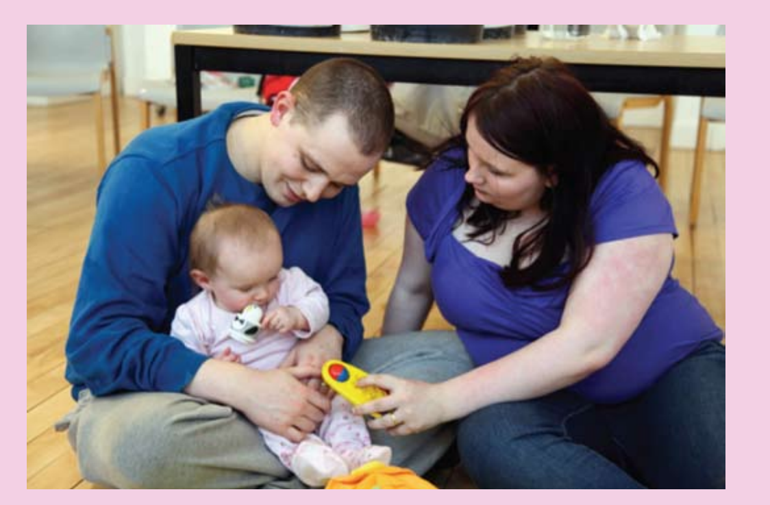
Family nurse partnership.

Partnership in the US was a good model of what can be done. A similar model was introduced in the UK, called the family nurse partnership (FNP) and it was introduced in Scotland in 2010. It offers intensive, structured home visiting support to firsttime mothers (aged 19 years or younger at conception). It aims to improve both the pregnancy outcomes for the woman and the health and development of the child, as well as to support future plans for the family. A randomised controlled trial of the programme in England recently reported no additional short-term benefits on the four primary outcomes investigated<sup>m</sup>. The Scottish Government, however, is interested in both understanding the longer-term impact of FNP, and its impact on a different set of outcomes, some of which showed improvements in the English trial, and an evaluation of FNP in Scotland using a natural experiment approach is currently underway. Case study research by the GCPH on assets-based approaches within services included the FNP team covering Glasgow City<sup>34</sup>. The FNP was reported to offer a different approach to interacting with service users, by taking a strengthsbased approach which works with expectant mothers' intrinsic motivation to do the best for her child and seeks to develop and expand the strengths within a family to promote change<sup>34</sup>.