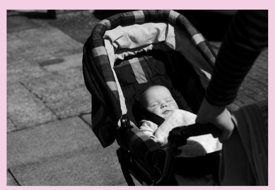
Image taken from "Poverty, parenting and poor health: comparing early years' experiences in Scotland, England and three city regions". GCPH; 2013.