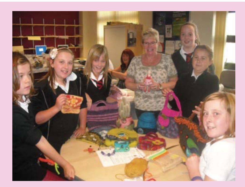
Image of Fair Isle Primary School's Opportunities for All project taken from "Assets in Action: illustrating asset-based approaches for health improvement" . GCPH; 2012.

Fair Isle primary school initiative, Opportunities for All – The initiative provided a range of activities for parents and children to participate in together and parents were supported to be aware of the impact of their behaviour on their children and were provided with resources to inform choices. Importantly, with the help of a family worker, the project provided a clear link between home and school life with a focus on early intervention across a range of issues affecting families (e.g. housing, unemployment, debt, relationships, addictions) and provided a crucial role in referring parents to other agencies and services to provide support.