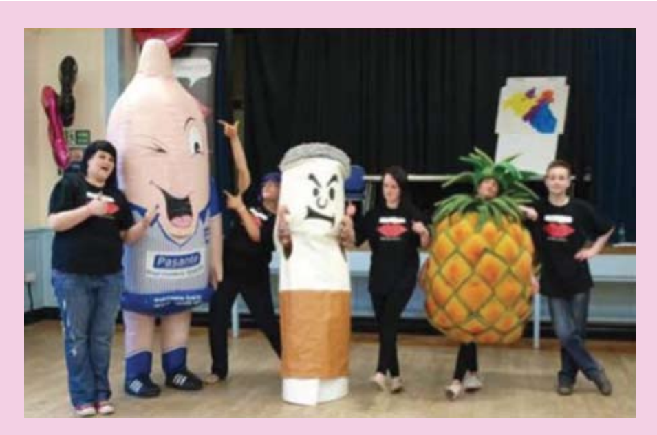
Image of The Big ShoutER project taken from "Assets in Action: illustrating asset-based approaches for health improvement" . GCPH; 2012.

The Big ShoutER project in East Renfrewshire, established by young residents to influence positive change in the design and delivery of their local youth services, has also been highlighted as an example of encouraging and supporting young people's active citizenship<sup>28,35</sup>. The project allows young people to be able to actively influence the design and development of health-related services, ensuring that the vision and ideas of local young people are recognised and addressed<sup>35</sup>. The direction of the project is led by the young people and staff work alongside to support them in a responsive and adaptable manner<sup>35</sup>. It was found that young people involved in the project developed new relationships and friendships and benefited from increased confidence, sense of purpose, self-belief and self-esteem<sup>35</sup>. Indeed, participation in civic engagement groups has been found to be associated with positive health and wellbeing outcomes in children and adolescents<sup>28</sup>.