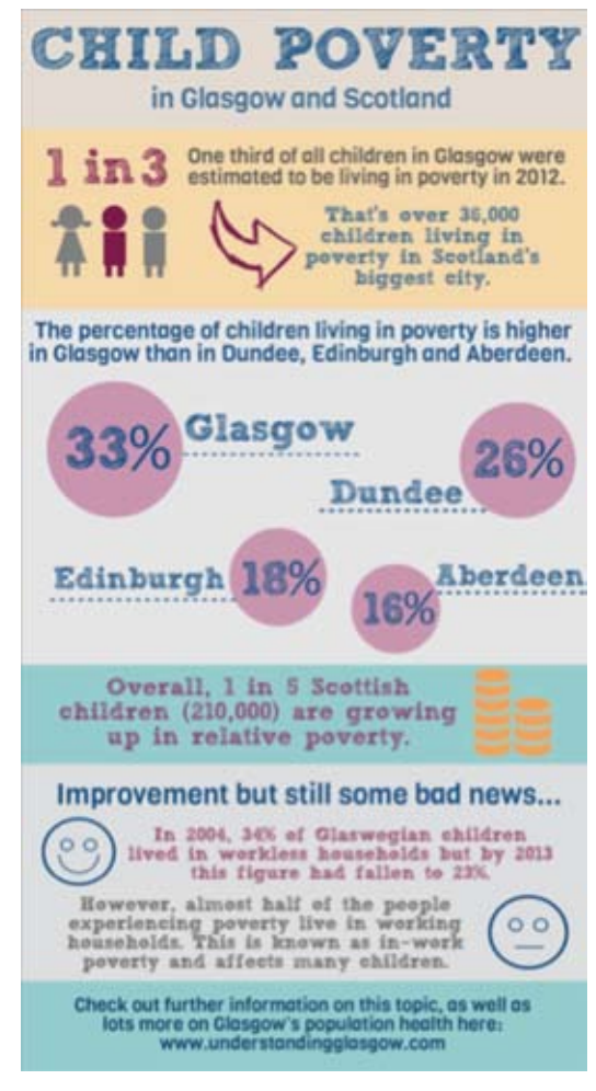
Figure 3: Child poverty in Glasgow and Scotland.

Given that Glasgow already has a higher proportion of people living in poverty across all age groups, it is predicted that many more Glaswegians, particularly children, are likely to suffer poverty in the future if these projections come to pass<sup>87</sup>.