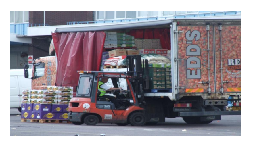
'Closed loop' systems