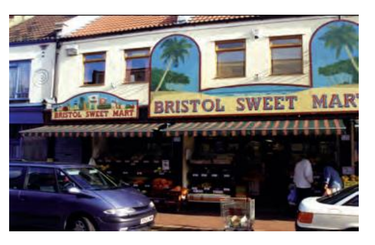
Diverse food retail